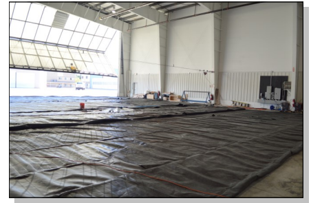
Fabrication of a large scale TCI CrossFilm™ secondary containment liner.