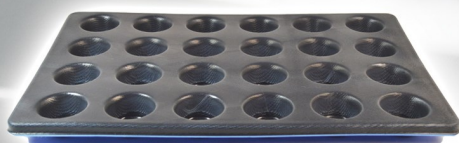
EVERFORM™ 24 CAVITY MINI MUFFIN