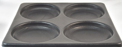
EVERFORM™ 4 CAVITY EGG TRAY