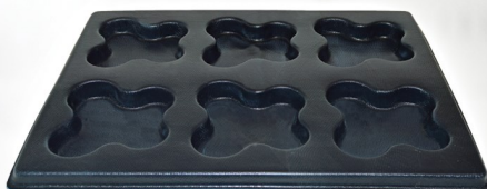
EVERFORM™ IRREGULAR EGG TRAY