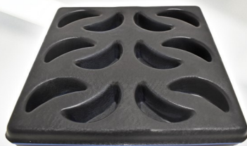
EVERFORM™ 12 CAVITY GYOZA TRAY