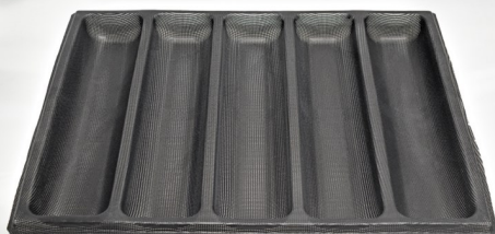
EVERFORM™ PERFORATED BREAD FORM FOR SUPERIOR HOT-AIR CIRCULATION

• perforation patterns and size can be adjusted to meet customized demands of heat transfer.