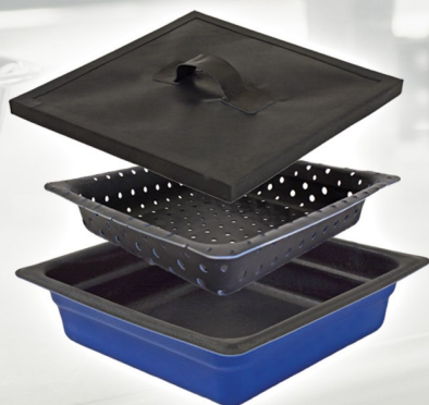
EVERFORM™ STEAMER BOWL SET