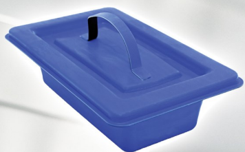
EVERFORM™ LOAF PAN SET

LOW-COST TOOLING ALLOWS FOR QUICK & EASY PROTOTYPING OF NEW DESIGNS. WITH OVER 150 DESIGNS, THESE ARE JUST A FEW EXAMPLES-