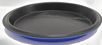
EVERFORM™ SINGLE CAVITY BOWL