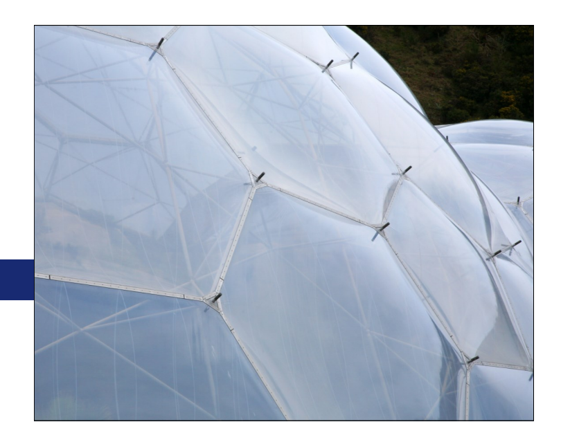
TCI's Reveal<sup>™</sup> ETFE Films Availability